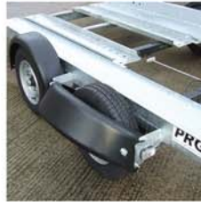
HINGE DOWN OFFSIDE MUDGUARDS