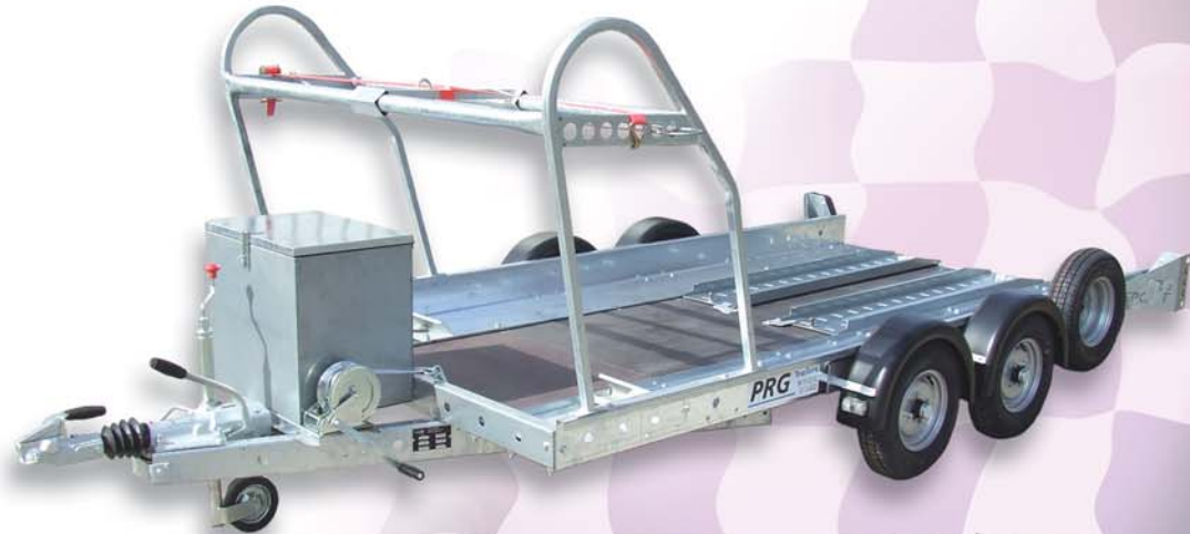
MINI SUPERSPORT WITH OPTIONAL CENTRE DECK, TYRE RACK, WHEEL CHOCKS AND JERRY CAN STORAGE BOX