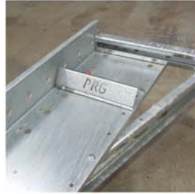
OPTIONAL ADJUSTABLE WHEEL CHOCKS