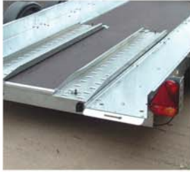
PRG 'SUREGRIP' RAMPS AND POSITIVE RAMP LOCATION