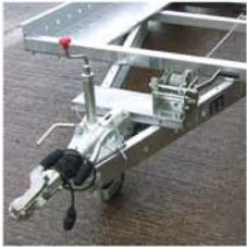
BRADLEY CAST HITCH AND OPTIONAL 2 SPEED MANUAL WINCH