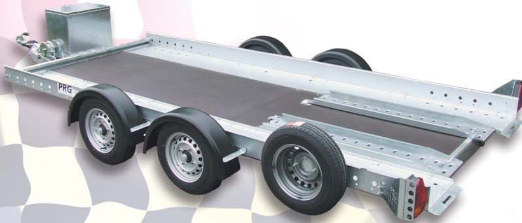
SUPERSPORT 12 WITH 5" 'SUREGRIP' RAMPS AND OPTIONAL CENTRE DECK AND JERRY CAN STORAGE BOX