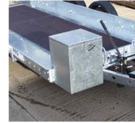
OPTIONAL JERRY CAN STORAGE BOX AND CENTRE DECK