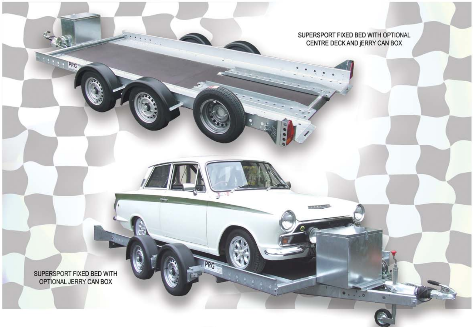
SUPERSPORT FIXED BED WITH OPTIONAL CENTRE DECK AND JERRY CAN BOX