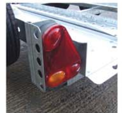
BOLT ON, WELL PROTECTED REAR LIGHTS