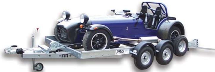
STANDARD MINI SUPERSPORT