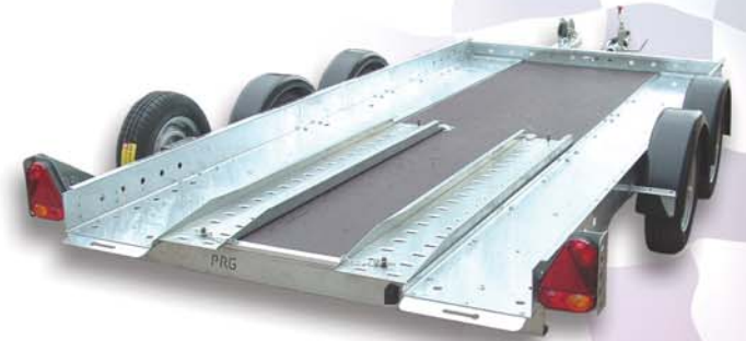
SUPERSPORT 14 WITH 6" 'SUREGRIP' RAMPS AND OPTIONAL CENTRE DECK